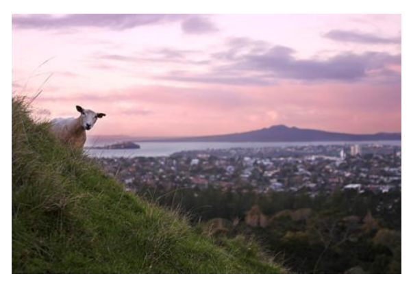
Shane Heenan's Curious City (Auckland Photo Day, 2007)

The 18th annual Auckland Photo Day on Saturday, June 11, where photographers have 24 hours to capture images of life in their region, with Fujifilm X series cameras on offer. This year's competition is sponsored again by Fujifilm NZ. Previous Auckland Photo Day images on show in Takapuna's Shore City's Como Street entrance.