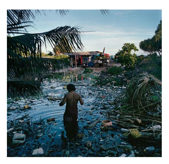
A man walks through flood waters in Tuvalu, where overpopulation has seen squatter settlements proliferate and escalating waste management issues.