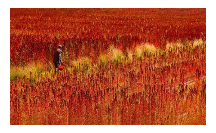
Jiongxin Peng's image, Hope of Field (below) won the 2021 Auckland Festival of Photography Late Harvest Award.

The Late Harvest Award is open to any photographers exhibiting in 2022's festival. Submissions open on 15 June, with prizes of $1500 and $750 on offer. Sponsored by wine-searcher.com