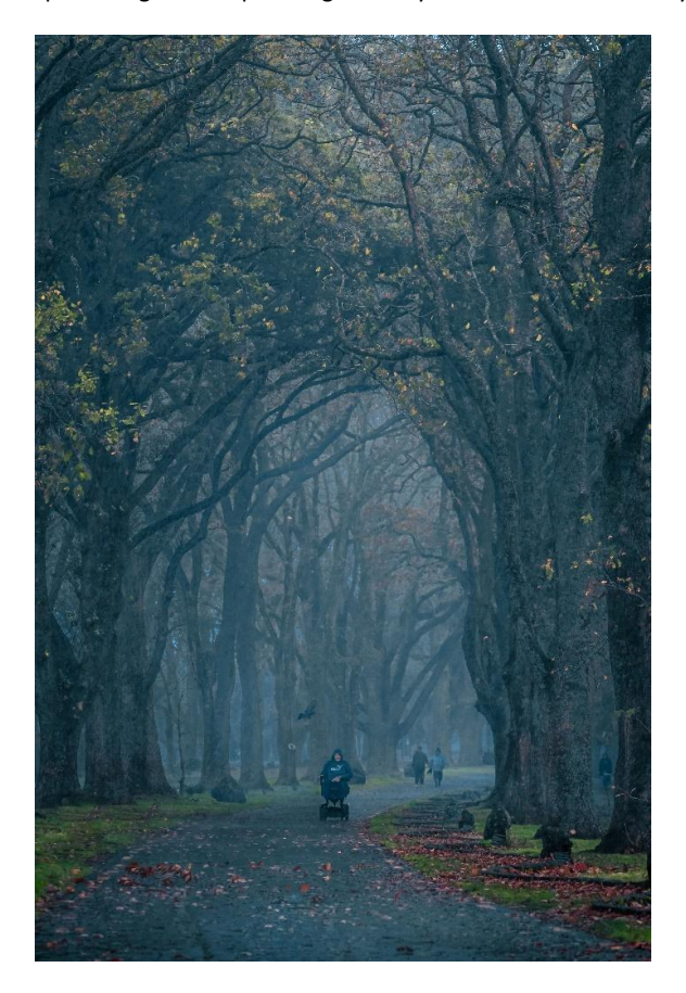
Second place: Gao Tao, Forgotten Forest Prize – FUJIFILM X-T30 II XC15-45mm Kit Black

"We want to congratulate this year's Auckland Photo Day winners and all those who entered this year's competition, and have added to an archive capturing our region's diversity and communities over time. Thanks too to FUJIFILM for sponsoring camera prizes again this year. We also invite everyone to be the judge in our People's Choice online vote."