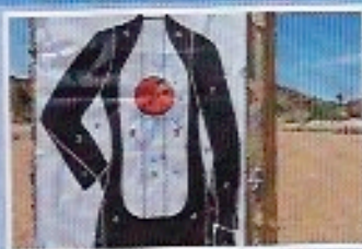
Herlinde Koelbl, Man