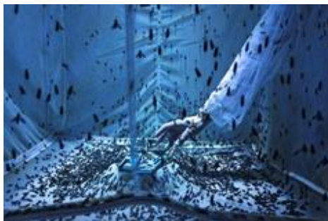
Zero Hunger by Maurizio Di Pietro (Italy)

ZERO HUNGER reflects Italian photographer Maurizio Di Pietro's interest in subjects that reveal the fragility and resilience of life, and how environmental issues' intersect with social concerns. His storytelling is a call to action, advocating sustainable solutions to the growing food crisis exacerbated by climate change, particularly the potential of insects as a protein source.