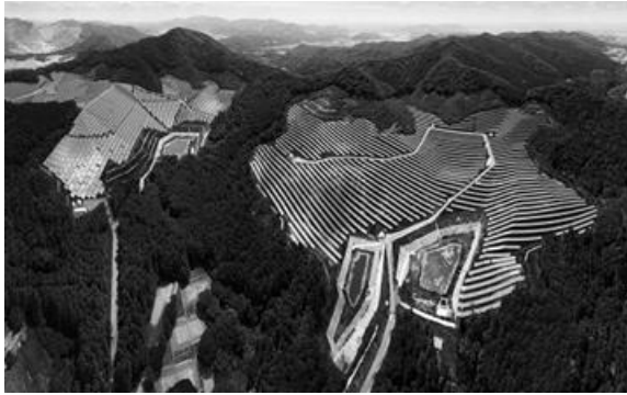
Lost Forest - Tochigi - 2024 by Hiroaki Hasumi (Japan)

LOST FOREST - THE OTHER SIDE OF DECARBONIZATION by Japanese artist, Hiroaki Hasumi, focuses on modern energy policies that purport to protect the environment but destroy it. “Building mega solar power plants is appreciated as a solution for climate change,” Hiroaki Hasumi says, “but on the other hand, it is associated with deforestation and ecosystem destruction”.